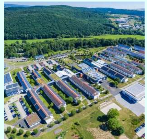
ZERO EMISSION CAMPUS BIRKENFIELD, GERMANY