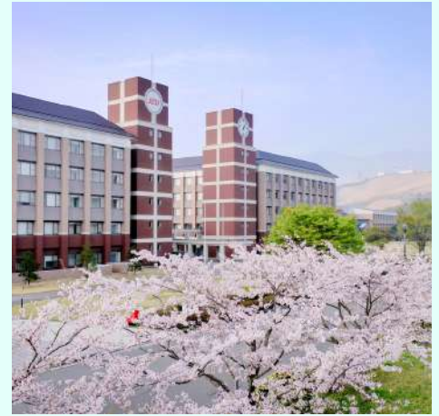
APU CAMPUS BEPPU, JAPAN

The IMAT Program is a dual degree program between APU and the Institute of Applied Material Flow Management (IFaS), an innovative research institute of the Trier University of Applied Sciences.